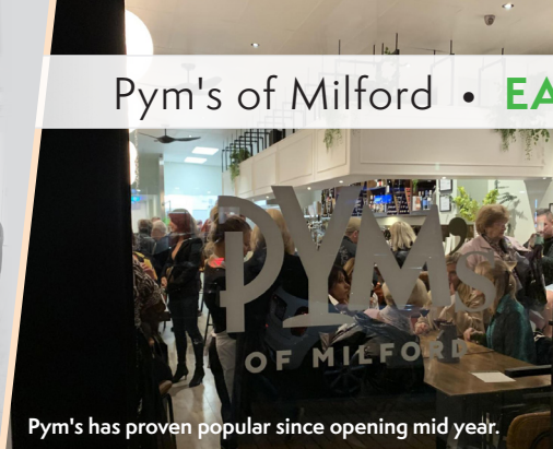
Pym's has proven popular since opening mid year.