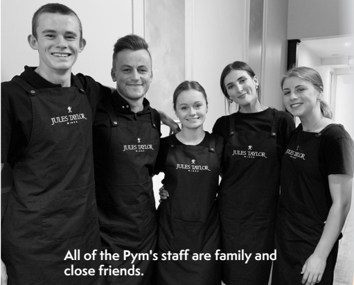
All of the Pym's staff are family and close friends.