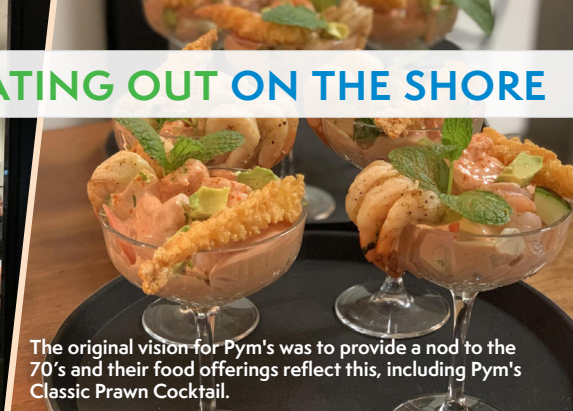
The original vision for Pym's was to provide a nod to the 70's and their food offerings reflect this, including Pym's Classic Prawn Cocktail.